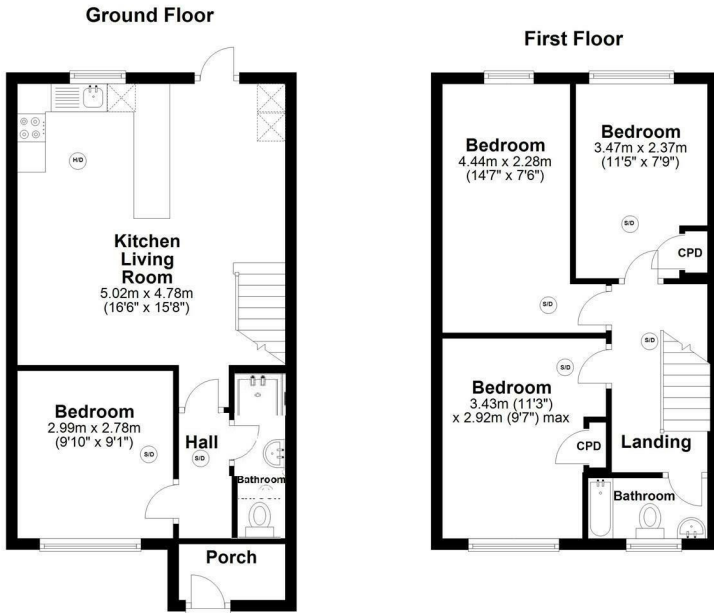
12 Fair Green Way, Selly Oak, Birmingham